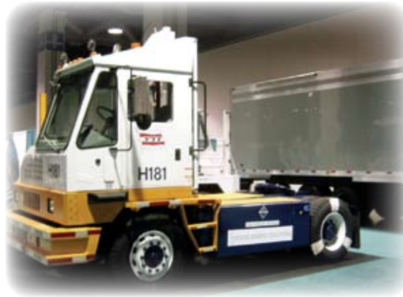
Figure 5 LNG yard tractor being tested at Port of Los Angeles

Once removed from ships by large fixed electric cranes, containers are transferred to rail and trucks by specially designed cargo handling equipment. The major category of cargo handling equipment used at ports is yard tractors, also called hostlers. Operating within port terminals, they are essentially scaled down versions of heavy duty trucks that operate on public roads at highway speeds. Yard tractors operate only at low speeds and are powered by medium duty engines, roughly 6.0 liters in size, producing between 100 and 250 horsepower. 35