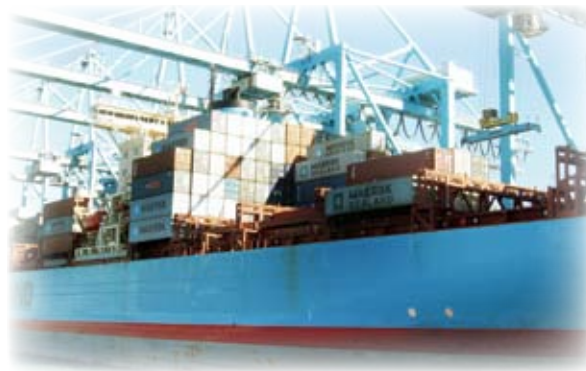
Figure 4 Ship at berth in the Port of Los Angeles

The average bunker fuel used in ships is somewhat cleaner than the maximum allowable, containing an estimated 27,000 ppm of sulfur. Even so, burning this fuel means that an average transoceanic container ship arriving at a port will emit more diesel air pollution than would a regional or long haul truck carrying a container away from the port driving three trips around the world.