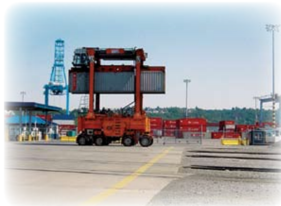
Figure 6 Rubber tire gantry at Tacoma

Rubber tired gantry and smaller straddler cranes are other examples of cargo handling equipment. Both are U-shaped moveable hoists on wheels used to stack containers while they are awaiting assignment to trucks and rails for transit off the port. Finally, there are smaller cargo handling vehicles—including top picks, side picks and forklifts—capable of moving individual containers short distances between storage stacks and yard tractors or between yard tractors and regional trucks or railcars.