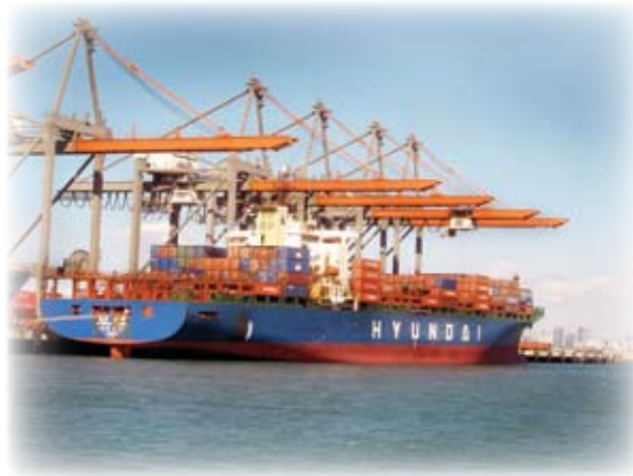
Figure 1 Container ship at berth at Port of Los Angeles

Port pollution is bad and rapidly getting worse. Oceangoing container ships make more than 10,000 visits to U.S. ports from around the world each year. The largest foreign goods provider of course is China, and the largest importing state is California. Container ships make nearly half of total ship visits to California, 4,727 out of 9,613 in 2004. 3 These ships arrive in the U.S. completing journeys similar to those onboard the imaginary ship, and the environmental damage they cause extends beyond the narrow boundaries described above, affecting even the planet as a whole through emissions of greenhouse gases that cause global climate change. The tremendous rate of growth in transoceanic shipping as American consumers continue to turn to cheaper imports raises the environmental stakes posed by global container shipping.