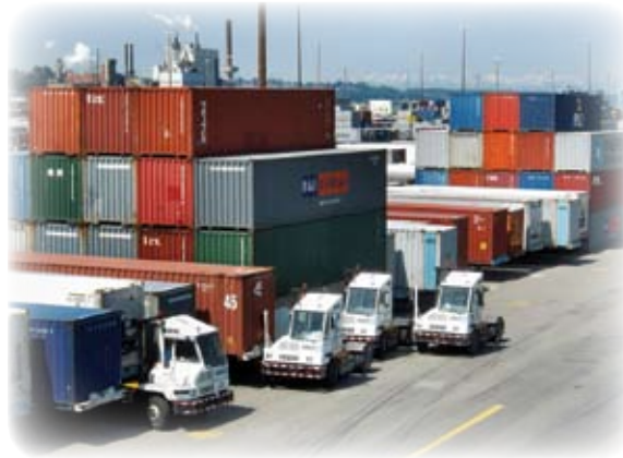
Figure 2 Yard tractor at Tacoma

they are docked. Other fuels and technologies could also be viable and some programs are underway at ports to test their applicability. Biodiesel, which can be produced from renewable domestic crops, is currently used to power vehicles at the northwestern ports of Seattle and Tacoma, Washington.