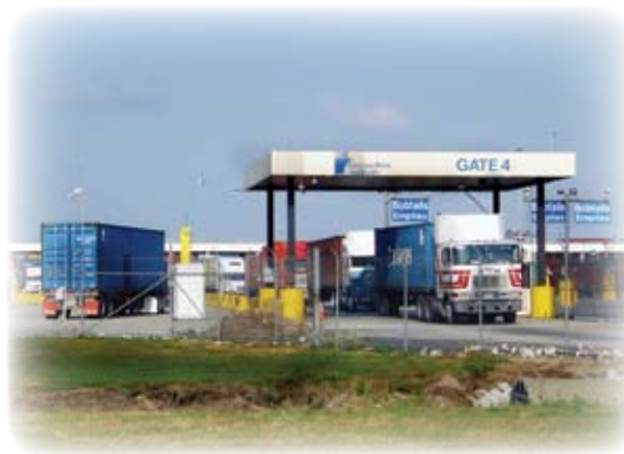
Figure 7 Onroad trucks at Savannah

Approximately 30,000 onroad heavy duty semitrailer trucks routinely transport containerized and bulk cargo to and from the 10 largest container ports in the U.S. Because most trucks pick up several containers in the course of a day, the total number of truck arrivals and departures, called truck “gates,” are over 70,000 per day. Trucks that transport containers to and from ports are almost universally large class 8 tractors with maximum hauling capacities up to 80,000 pounds. Roughly three-quarters of all cargo containers leaving U.S. ports are carried on these trucks. Most of the remainder leave by rail.